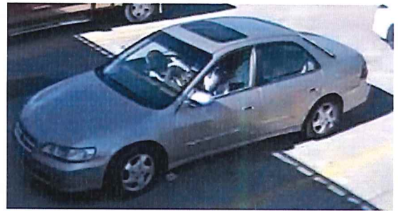
Actual Photos of Vehicle